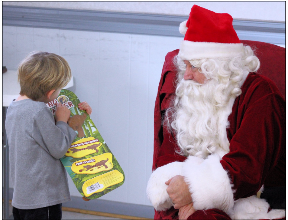
This youngster was so thrilled with the toy he received at the Breakfast with Santa that he had to tell Santa all about it!