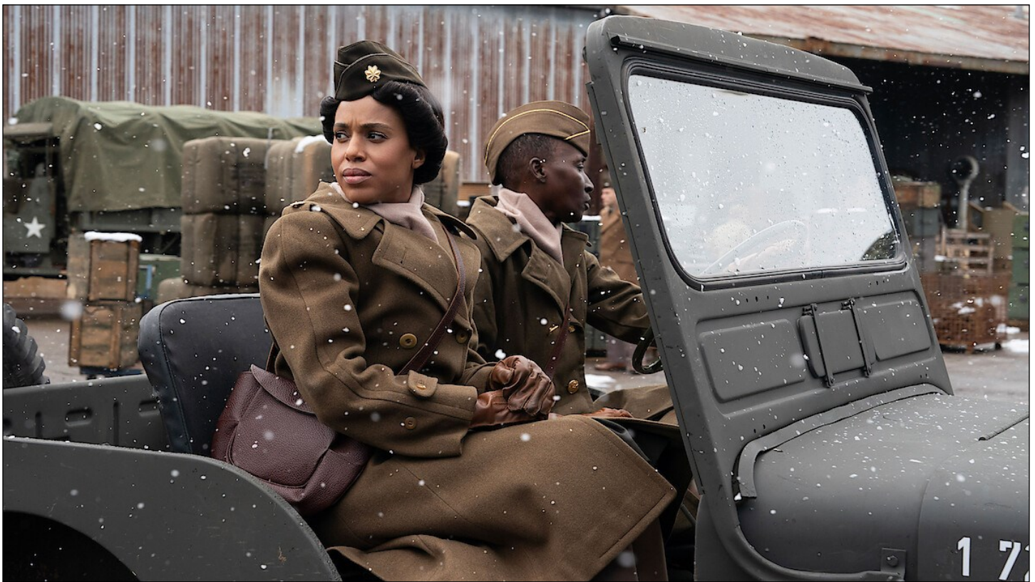
Kerry Washington portrays Army Maj. Charity Adams, commander of the 6888th Central Postal Directory Battalion in the Tyler Perry written and directed film, The Six Triple Eight, released on Netflix over the Christmas holiday.