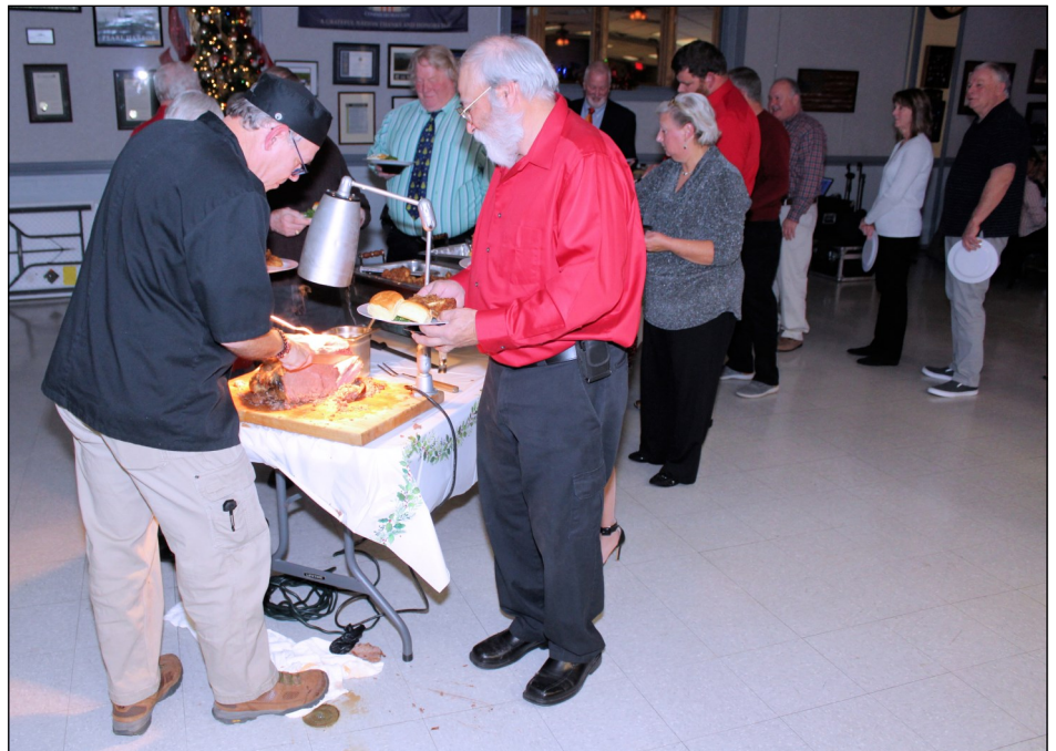
Post members got into the holiday spirit at the annual Post Christmas Party, Dec. 14, where they were treated to a catered buffet and dancing to the band, "Border-town."

some 72 needy families received seven grocery bags of groceries, including a turkey. Food for this year's food basket drive was procured from the Fort Gregg-Adams Post Commissary.